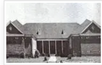
Hillsborough High School for Negroes

Hillsborough High School for Negroes built; 12-room building, grades 1-11. Had only library for Negro community. Only school for Blacks in Orange County (exc. CH). Many students walked for miles to attend.